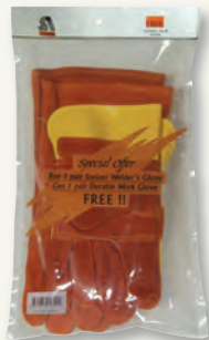
Packaged for display