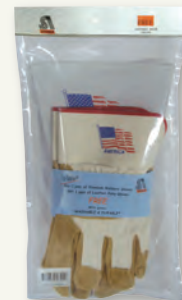
Packaged for display